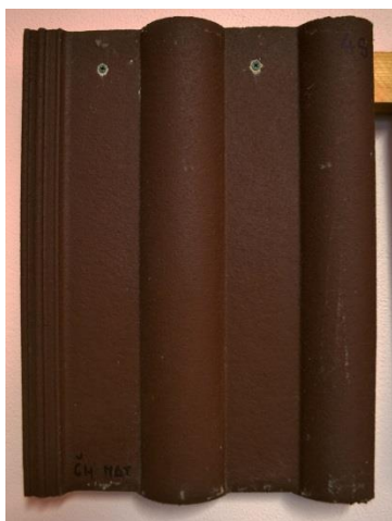
ČH MAT 4S