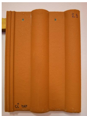
CČ MAT 2S