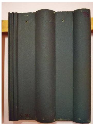
BČ MAT 3S