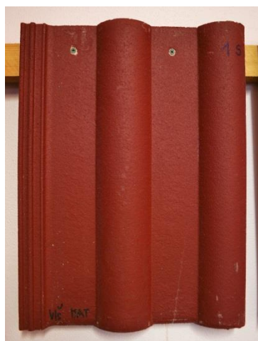
VIŠ MAT 1S