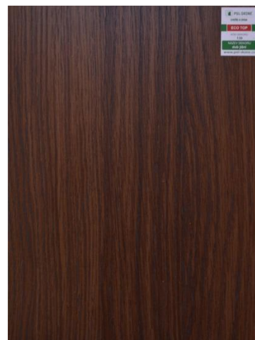
139 Dub jižní