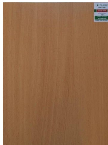
122 Buk Bavaria