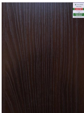
136 Akát tmavý