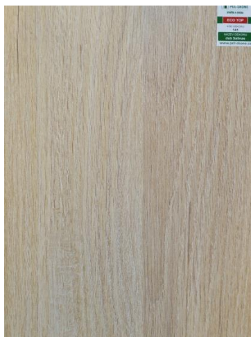
141 Dub Salinas