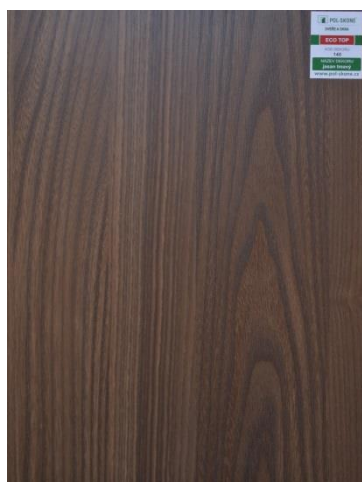
140 Jasan tmavý