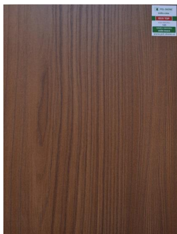
145 Arálie tmavá