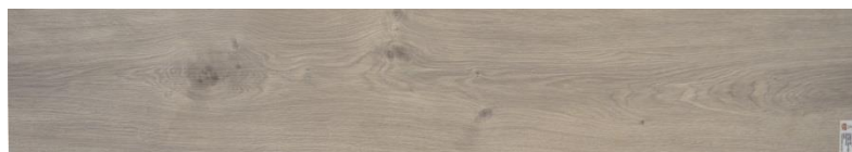
CW 738x – Super Matte