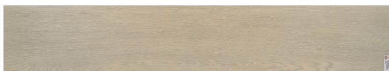
CA 932x – Super Matte