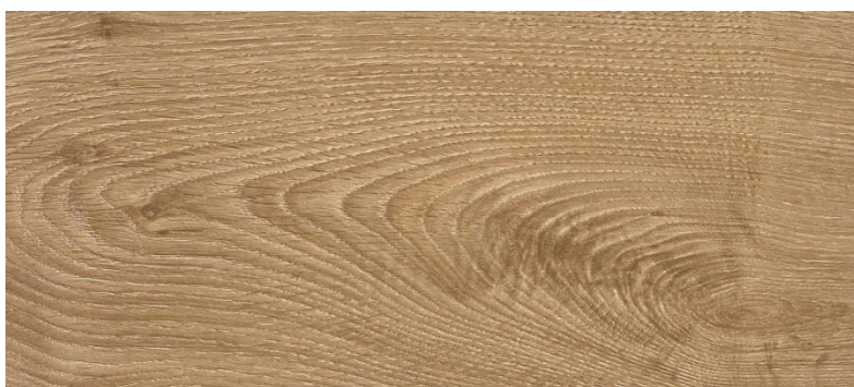
Dub Brione AV 37345