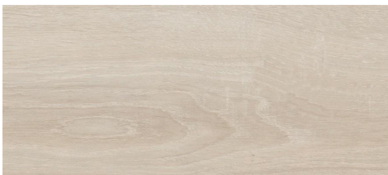
Dub Rialto AV 34237